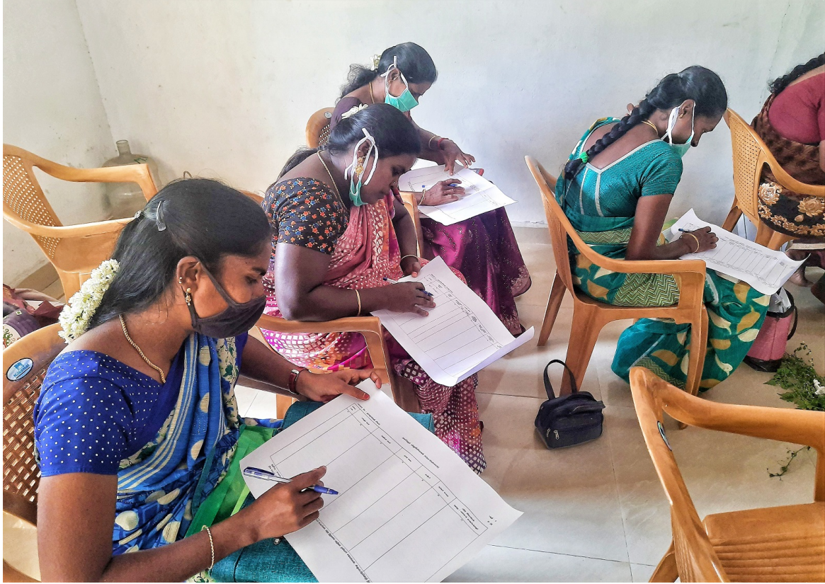
Participants in a training at Pallaiyur Village Panchayat Office, Nagapattinam district