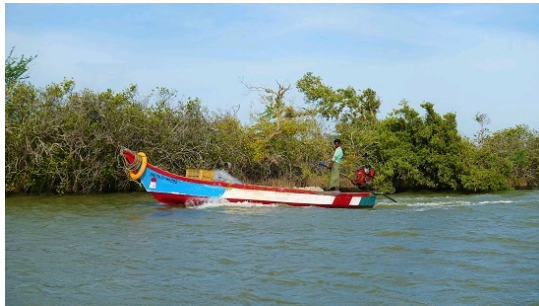
Mangroves at Muthupet, Thiruvapur

Integrated Management of Point Calimere Ramsar Site - Current Status, Trends and Challenges A two-day workshop, jointly organised with the Tamil Nadu Forest Department in Nagapattinam on 26-27 August, helped in establishing the main features of the wetland, observe changes