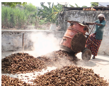
L. to r.: Picture of Kausalya Devi, one of master trainer of sustainable turmeric cultivation with FSA-certified turmeric from her field ; boiling of Turmeric rhizomes and spreading on drying yard for sun-drying over the next 21 days.