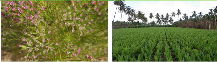
L. to r.: A glimpse of cumin farm from Rajasthan ; healthy vegetative phase of turmeric crop in Erode district, Tamil Nadu.