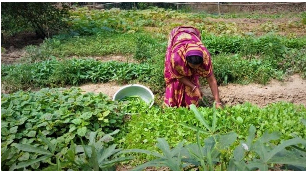
Vegetable garden at a village in Kendrapara district, Odisha