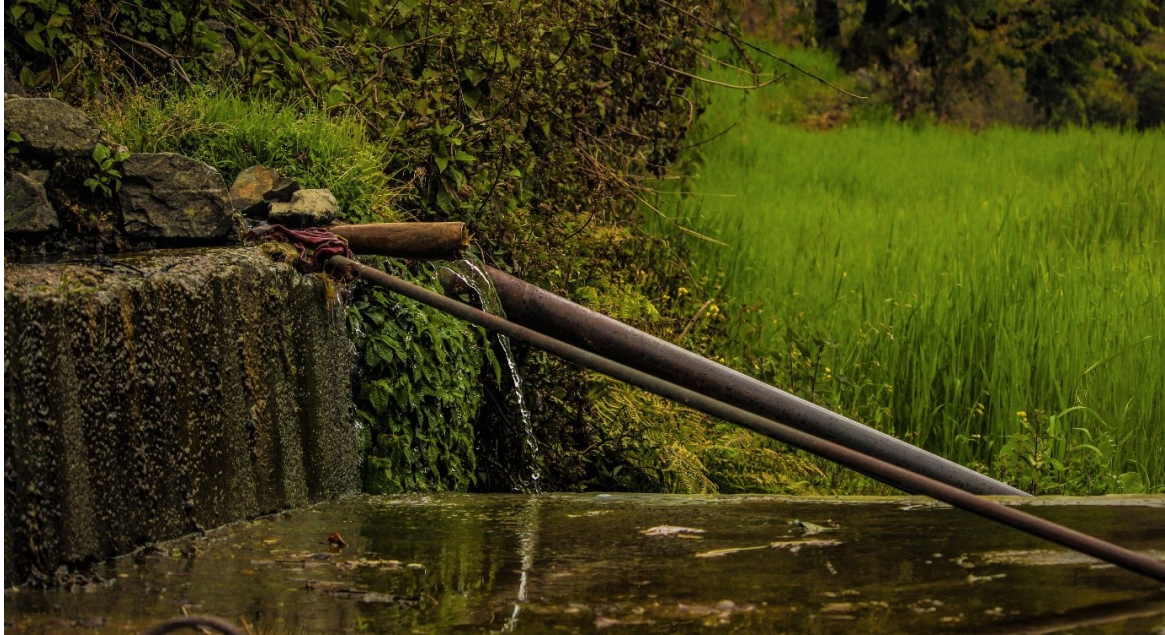
Water source at Bohal, Himachal Pradesh